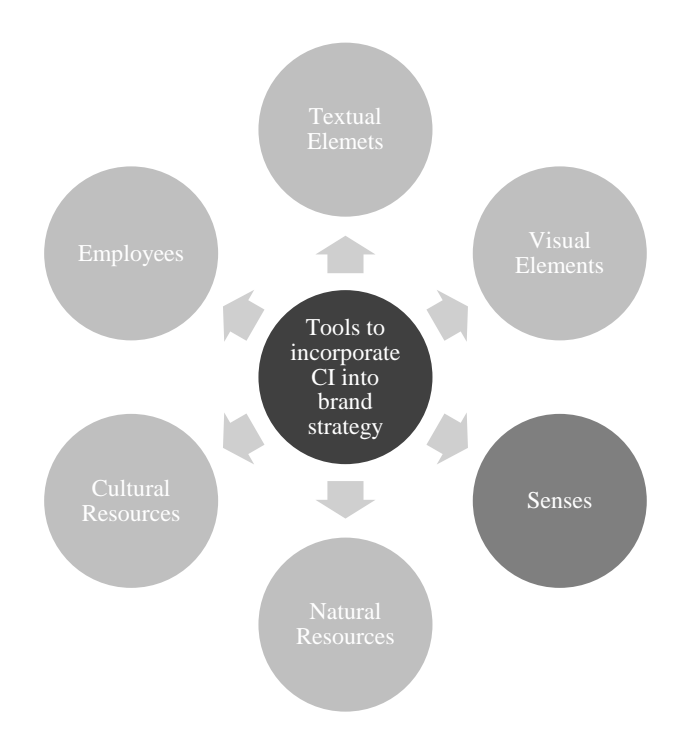
Figure 1 – CI tools that can be used by the Brand