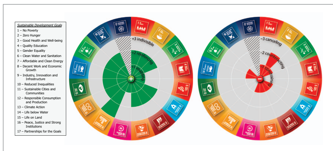
Figure 2. Nature of the interactions between SDG7 (Energy) and the non-energy SDGs. The relationships may be either positive (left panel) or negative (right panel) to differing degrees. See table 1 for definitions pertaining to each score from +3 (positive) to -3 (negative) in integer increments. The absence of a colored wedge in either the left or right panels indicates a lack of positive or negative interactions, respectively; if wedges are absent in both panels for a given SDG, this indicates a score of 0 ('consistent'). Only one positive or negative score is shown per SDG; in instances where multiple interactions are present at the underlying target level (positive and negative treated separately), the individual score with the greatest magnitude is shown. Note that, while not illustrated by this figure, some SDG linkages may involve more than simple two-way interactions (e.g. the energy-water-land 'nexus'). As described in the text, no scoring is done for the 'means of implementation' goal, SDG17.

the underlying target level (positive and negative treated separately), the individual score with the greatest magnitude is shown.) In other words, efforts to ensure access to modern energy forms for the world's poorest and to deploy renewables rapidly and accelerate the pace of energy efficiency improvements in all countries should, more often than not, be to the benefit of the broader sustainable development agenda—vis-à-vis a world in which vast inequalities in energy access remain and where energy supply, conversion and demand activities are inefficient and fossil-dependent. There are instances, however, where dis-benefits, or trade-offs, could emerge.