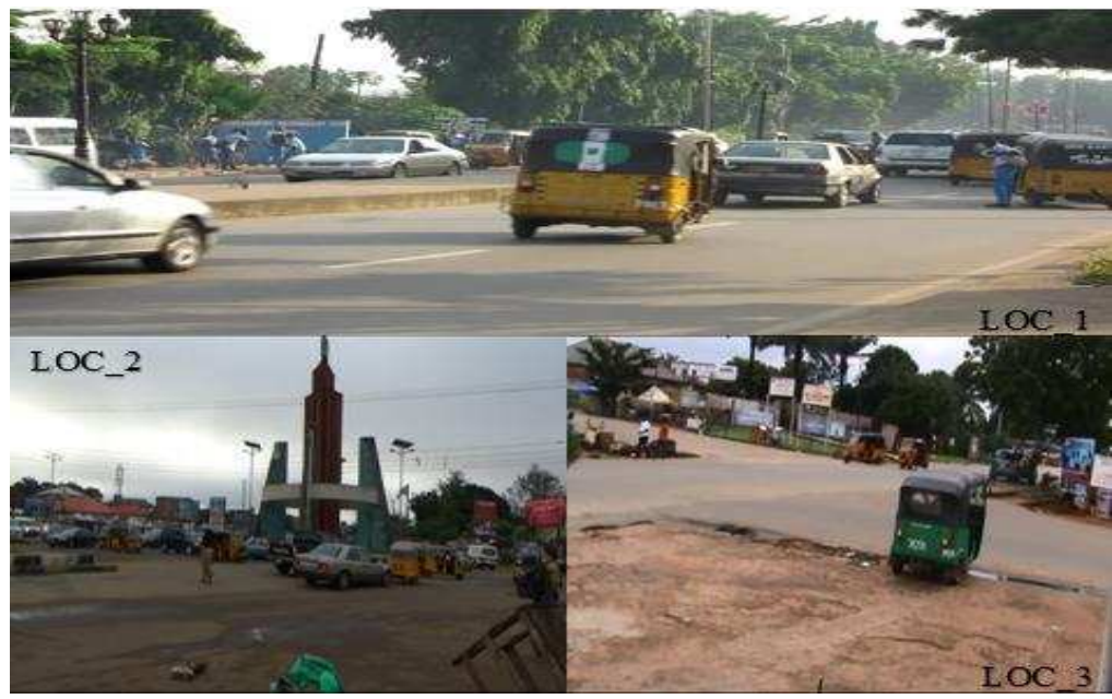
Figure 1: Study locations