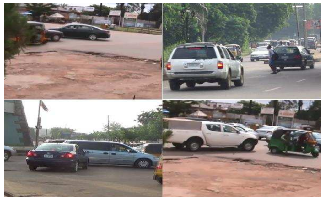
Figure 4: Examples of observed conflicts

LOC_3 is quite different from the others both in layout, traffic enforcement and regulation. With 10.8 conflicts being observed at this location every hour, 62% were serious, spilt evenly across peak and off peak times. Almost 90% of these were either vehicle-vehicle or vehicle-tricycle conflicts; five actual collisions took place. Considering lower traffic volume at this location, it could be considered as being more risky than the other locations, especially for vulnerable road users. Unlike the other previously discussed locations, more conflicts involving vehicle-pedestrian, vehicle-tricycle and tricycle-tricycle were observed during the off peak period. The majority of conflicts recorded during both the peak and off peak periods were crossing conflicts. A high number of opposing conflicts were also observed here unlike the other locations. Figure 4 shows examples of some observed conflicts.