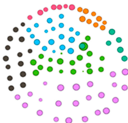
Figure 2. The layered configuration of the six clusters.

indicating the strong relationship between the nodes within each cluster but a stronger relationship between the nodes in different clusters. This result is evident when comparing the configurations with and without the edges/arcs, as shown in Figures 2 and 3.