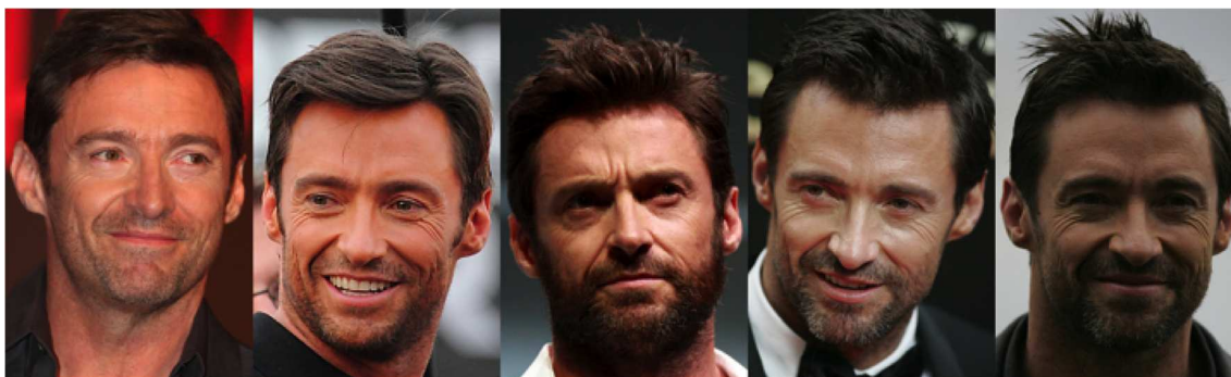
Fig. 2 Multiple photos of the same actor. There are very large differences between these images, but viewers familiar with the actor have no problem recognizing him in each of them. Image attributions from left to right: Eva Rinaldi (Own work) [CC BY-SA 2.0], Grant Brummett

(Own work) [CC BY-SA 3.0], Gage Skidmore (Own work) [CC BY-SA 3.0], Eva Rinaldi (Own work) [CC BY-SA 2.0], Eva Rinaldi (Own work) [CC BY-SA 2.0]