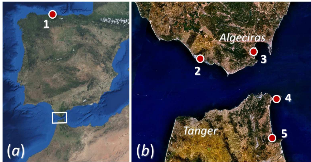
Figure 2. Location of the archaeological sites referred to in this study. Panel (a) shows the location of La Campa de Torres, Asturias (1), and the general location of panel (b) (box). Panel (b) shows the location of the four archaeological sites in the Strait of Gibraltar: (2) Baelo Claudia, Tarifa; (3) Iulia Traducta, Algeciras; (4) Septem, Ceuta; and (5) Tamuda, Tetouan. Satellite images from NASA World Wind (open source).