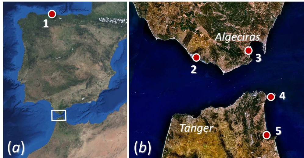
Figure 2. Location of the archaeological sites referred to in this study. Panel (a) shows the location of La Campa de Torres, Asturias (1), and the general location of panel (b) (box). Panel (b) shows the location of the four archaeological sites in the Strait of Gibraltar: (2) Baelo Claudia, Tarifa; (3) Iulia Traducta, Algeciras; (4) Septem, Ceuta; and (5) Tamuda, Tetouan.