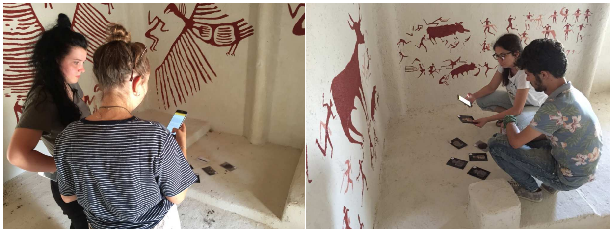
Figure 3: Pairs of users touring Çatalhöyük’s replica houses as part of a collaborative digital experience centered around reflecting on egalitarian ways of life.

The data collected during the evaluation included audio recorded through dictaphones, lapel microphones, and in some cases video cameras; standardised observational notes produced by a researcher during each tour; and 30 to 60-minute audio-recorded interviews conducted with each pair immediately following their tour.