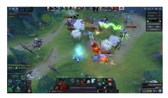
Figure 1. In-game view of Dota 2 as seen by the players and the audience.

having unique skills and play styles. At the start of the game, heroes find themselves in their own base (one base per team) located at opposite corners of a square-shaped virtual arena, consisting of forests, three roads and a river. The overall aim of the game is for teams to defend their own base while destroying the enemy base. To fulfil this objective, players need to first strengthen their heroes, by collecting two basic types of in-game currencies: gold and experience. Gold can be used to purchase virtual items that make heroes more powerful. Experience (XP) allows heroes to level up, increasing their overall strength. Gold and XP are obtained by killing enemy heroes, or computer-controlled monsters called creeps that are scattered across the arena. In their effort to compete for resources and conquer each other's base, teams often clash. When taking too much damage, heroes can "die", rewarding the enemy team both gold and XP, as well as sending the dead hero back to its base. Killing enemy heroes allows teams to temporarily outnumber the enemy team, creating further tactical advantage and opportunities to break down the enemy's defence. Matches have no predetermined length, but typically last anywhere from 20 minutes to over 1 hour.