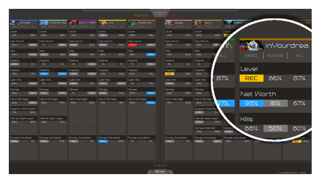
Figure 2. Basic view of Echo , showing each Player's live performances as percentiles of historic data.