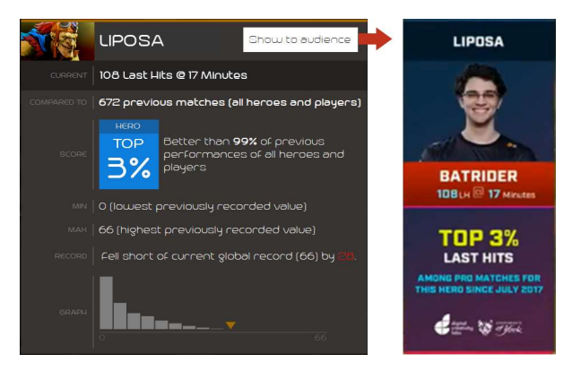
Figure 3. Detailed view of a particular KPI. If "Show to audience" button is pressed, Echo triggers the graphics system to show a graphical overlay to the audience.

time" records or extraordinary performances across heroes. Values that exceed any value in the scope are marked with "REC" = record. Negative records (worst values ever observed in each respective scope) are marked as "LOW". Values that exceed certain thresholds are colour coded (yellow = record, purple = top 1%, blue = top 5%, red = negative record). The colour coding assists the operator with identifying interesting constellations. For instance, in the row Networth highlighted by the magnified portion of Figure 2 one can deduce that for the hero, the player lies within the top 2% of historic performances, but does relatively poorly (bottom 16%) compared to their personal match history. This indicates that this player usually picks heroes that are capable of obtaining gold faster. The third column tells us that in the global reference frame, taking into account all heroes and players, the player performs only above average.