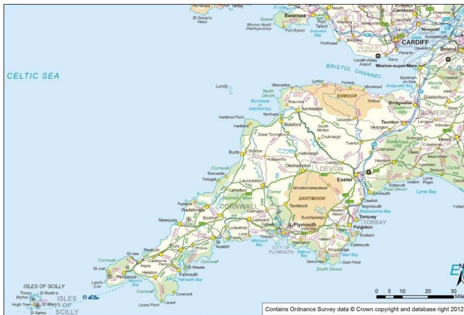
Figure 1. Location of the Isles of Scilly relative to the South West of England.

Figure 1 shows the location of the islands relative to the south-west English mainland. It also indicates the mainland departure points for the islands. The islands are accessible by air and sea. Light aircraft fly between St. Mary's, and Land's End or Newquay all year round (weather-permitting), and the trip takes between 15 and 25 minutes. The islands also have a passenger ferry service which operates between Penzance and St. Mary's between Easter and October. At all other times, the only scheduled boat is the freight service, which serves the islands three times a week year-round.