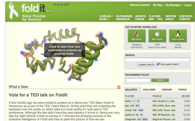
Figure 1: Foldit homepage ( http://fold.it/portal/ )

forum and chat tools. Leaderboards are used to rank players according to their scores.