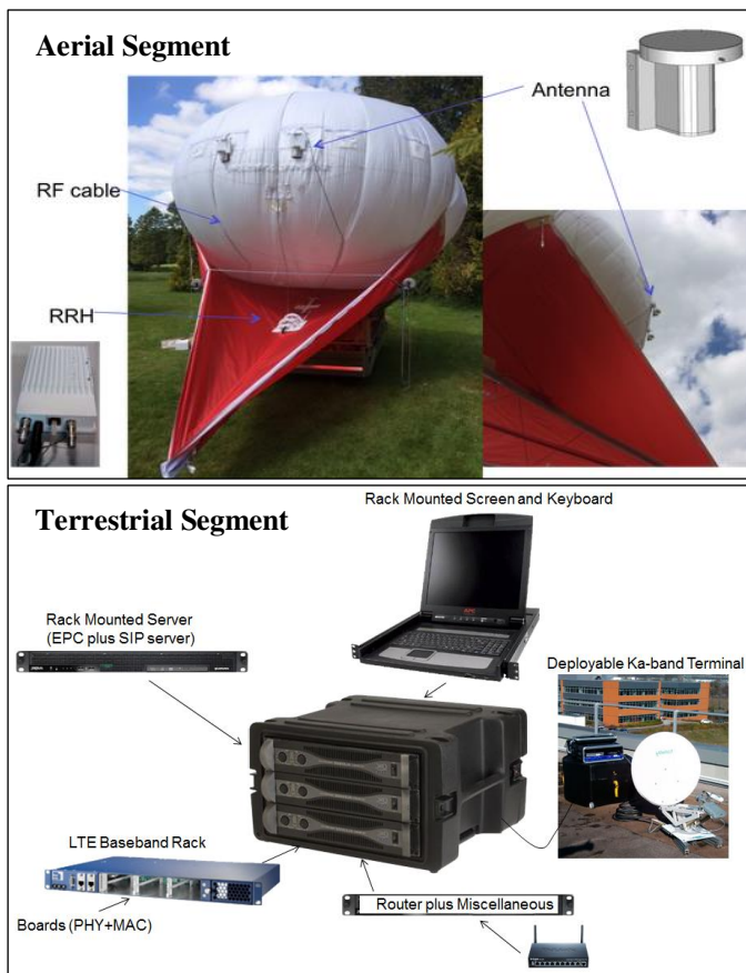
Figure 3. Aerial-eNodeB implementation: aerial segment (RRH and antenna) and terrestrial segment (EPC, LTE base band Ka-band equipment) pictures during validation phase.

An important component of the aerial segment is the Helikite, which is a helium inflatable kite that relies on lighter-than-air principles to achieve buoyancy, with increased lift and stability thanks to its kite profile and the use of a tether (which is moored to the terrestrial segment). Helikites aerostats are reliable in high winds, heavy rainfall or very dusty conditions. The ABSOLUTE system uses moderate sized helikites of 34m 3 , highly mobile, simple/fast to set up, and only require a few days training for the operators. This helikite is 6.5 meters long, 5 meters wide, and has a net helium lift in no wind, in dry conditions, of 14 kilograms. Note that rainfall, snow, sleet etc. will reduce the lift by 3 kilograms or so. Therefore, this leaves about 10kg for maximum payload, including RRH, fiber-optic, batteries, waterproof cases, etc.