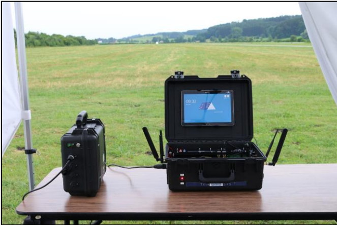
Figure 4. Portable land mobile unit equipment (PLMU, on the right) and its battery (on the left) during validation phase.

The PLMU corresponds to the terrestrial communication segment of the ABSOLUTE architecture. This unit is deployed on the ground and therefore offers a smaller coverage compared to that reached with the AeNB. However, it provides additional wireless communication technologies and it is also highly modular for answering different users' needs. The PLMU has been implemented as a complete communication system embedded into a rugged suitcase as shown in Figure 4. It is composed of several components as listed in Table 1. The entire system can be powered either by a regular power outlet or by a battery pack providing up to several days of autonomy, depending on the battery capacity and the components being in use. The PLMU is modular and easily adaptable to the requirements of each specific emergency situation by using only the required communication technologies, which are switching on/off using the relay blocks module. External devices can be plugged to the PLMU for extending its capabilities, e.g. a satellite system for enabling satellite backhauling.