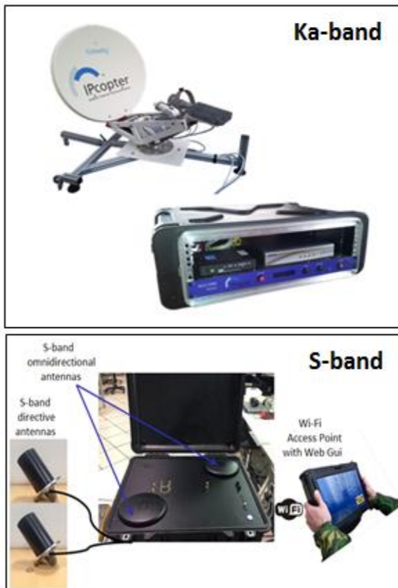
Figure 5. Ka-band Backhauling (Antenna and Suitcase Unit) and S-band Messaging (Modem, Wi-Fi and Antennas) Satellite Equipment.

The Ka-band backhauling makes use of the Tooway system of Eutelsat, that provides satellite broadband services over all Europe via the 82 spots of the high-throughput geostationary satellite KA-SAT, positioned at 9° East. The ground segment is composed of 8 terrestrial gateways, plus 2 for back-up, deployed in different regions and inter-connected in a fiber ring for maximum reliability. This backhauling solution provides a tried and tested, stable, and reliable platform able to perform any IP communication, from voice to data, from any location in Europe as long as there is line of sight from the terminal to the satellite.