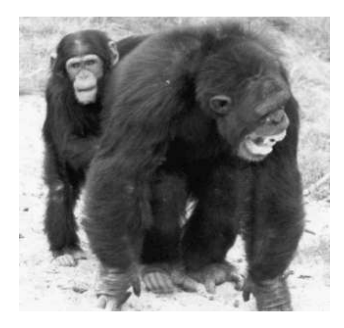
Figure 1. A juvenile chimp puts an arm around a screaming adult male who has just been defeated in a fight. After De Waal 2008: figure 1. Photograph by Frans de Waal.

fight (deWaal 2008, DeWaal and Aureli 1996), figure 1, and orang-utans might move aside leaves to let another pass by more easily (deWaal 2008: 285). Acts of 'selfless courage' have also been recorded in chimpanzees, such as the case of an adult chimpanzee that died rescuing a drowning infant from the moat around a zoo enclosure (Goodall 1990: 213; deWaal 2008: 289).