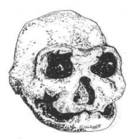
Figure 3: 'Toothless' crania from Dmanisi, c 1.77 million years old

An even earlier example of long term care comes from Dmanisi in Georgia, 1.77 million years ago (Lordkipanidze et al 2005), figure 3. One of the Dmanisi hominins had lost all but one tooth several years before death, with all the sockets except for the canine teeth having been re-absorbed. This individual could only have consumed soft plant or animal foods, necessitating support from others. Indeed, in reviewing all the documented lesions and non trivial pathologies in Lower and Middle Palaeolithic hominin specimens, a sample of more than twenty, Shang and Trinkaus (2008: 435) remark on at least some degree of survival from severe injuries in all cases.