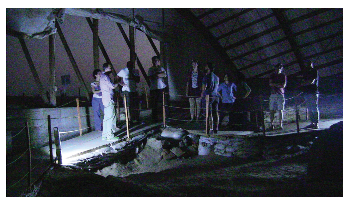
FIGURE 3. Group of archaeological specialists and heritage interpreters gathering in the North Area of Çatalhöyük at nightfall for a facilitated "body-storming" session, July 2015.