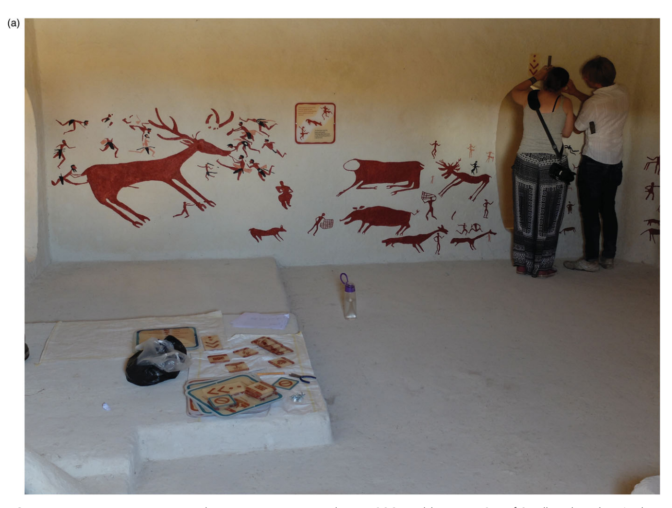
FIGURE 1. Heritage interpreters at work in various capacities at the UNESCO World Heritage Site of Çatalhöyük, Turkey: (a; this page) inside one of the recently installed replica houses, August 2017; (b; see p. 4) at the top of the South Area, August 2016; (c; see p. 5) inside the experimental house, August 2015.

It is this one-sided, rather facile concern for the "general public" that sits at the heart of my ensuing argument. The International Council on Monuments and Sites' Ename Charter refers to heritage interpretation as "the full range of potential activities intended to heighten public awareness and enhance understanding of cultural heritage sites" (2008:3; emphasis mine). Other definitions are not dissimilar, speaking of "a set of professional practices intended to convey meanings about objects or places of heritage to visitors or users" (West and McKellar 2010:166; emphasis mine). Jimson describes "the function of the interpreter" as "to mediate between the curator, concept developer, or institutional knowledge holder, and the visitor. The interpreter translates museum meanings to audiences" (2015:533; emphases mine). Even where attempts have been made to push the boundaries of the concept, for instance, Silberman's nuanced description of "the constellation of communicative techniques that attempt to convey the public values, significance, and meanings of a heritage site, object, or tradition" (2013:21; emphases mine), the core of the practice still seems presumed to be for nonspecialist publics in the