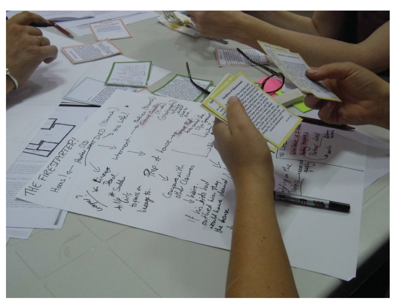
FIGURE 2. In-progress story-authoring session at Çatalhöyük, Turkey, including thematic cards and brainstorming sheets, July 2014.

others' comparable efforts). While I appreciate that systematizing creativity could lead to homogenized, insipid outcomes that achieve the opposite of creative inspiration, this is not my aim. Rather, I seek to embed the facilitation of creative interpretation into common archaeological practice. Here we can draw on user-centered, codesign, and participatory design methodologies to guide the approach. Therein, varying forms of embodied, personal, and collaborative expression—for example, oral, written, and visual brainstorming; speak-aloud protocols; drawing; modeling; crafting and other forms of making; performance; prototyping; physical enactment; play; and social interaction—are deployed among groups of individuals to promote thinking and meaning-making, concept exploration, heightened awareness, and the development of sympathetically designed outputs (e.g., see applications both within and beyond the cultural heritage sector in Fredheim 2017; Malinverni and Pares 2014; Pujol et al. 2012; Schaper and Pares 2016).