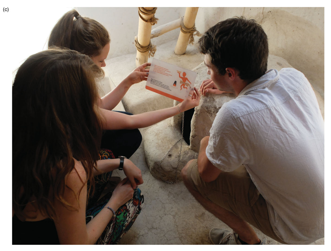
FIGURE 1. Continued