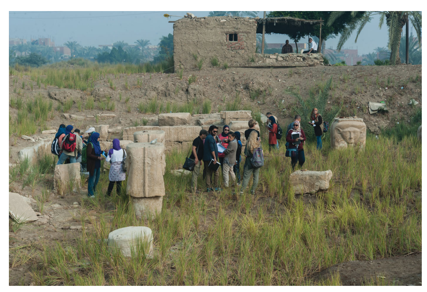
FIGURE 4. Ministry of Antiquities inspectors assessing the Hathor Temple at the site of Memphis, Egypt, as part of an exercise in developing an interpretative trail for visitors to Memphis, Autumn 2015.

insights" (2013:26). It is in the enabling of such narratives among archaeological specialists, I contend, that heritage interpreters hold untapped potential.