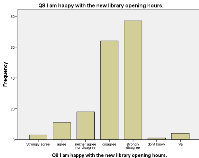
Figure 1. ‘I am happy with the new library opening hours’

A one-sample t-test showed that this disagreement was a statistically significant difference from the midpoint of the scale (‘3= neither agree nor disagree’) (t=15.77, p<0.001).