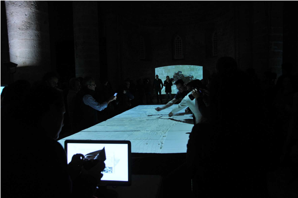
Fig. 3: The portable physical model as a material agent for reconciliation, courtesy of Hands-on Famagusta .