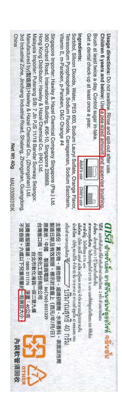
246x828mm (72 x 72 DPI)