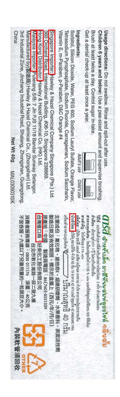
246x828mm (72 x 72 DPI)