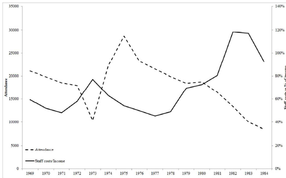
304x189mm (72 x 72 DPI)