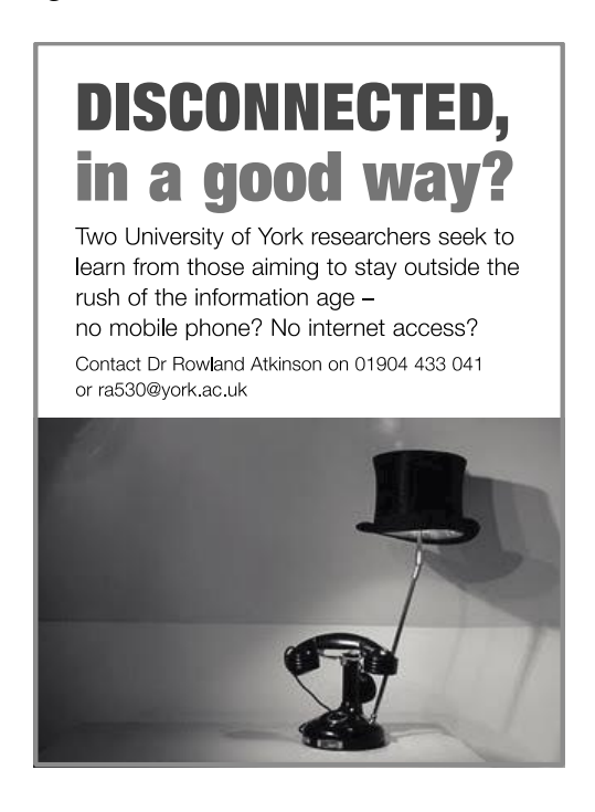
Figure 1. The London Review of Books advertisements.

respondents. The definition here refers to the desire and the actions taken to step outside techno-social practice, data and networks. While the sample is a narrow slice of the population, our intention was not to produce a generalisable dataset. Rather the primary goal was to enable access to the rich and value-laden interior world of the in-depth accounts of individuals engaged in disconnection practices. From this we aimed to generate more robust theoretical frameworks and ideas that could be pursued to develop a more adequate account of processes of social disconnection and information detachment.