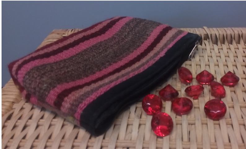
Figure 2. The ten gemstones used as spoils.