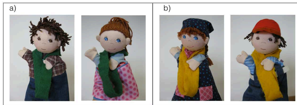
Figure 1. The puppets used in this study: a) The transgressors played by E1 (here wearing green group markers), b) The puppets played by E2 (here wearing yellow group markers).

A set of green and yellow scarves (two puppet-sized scarves and a child-sized scarf in each color; see Figure 1) were stored in a box with a lid. Ten fake red gemstones were used as spoils (see Figure 2). They were hidden in a small purse located on a box on the left side of the room (approximately 2m away from the door).