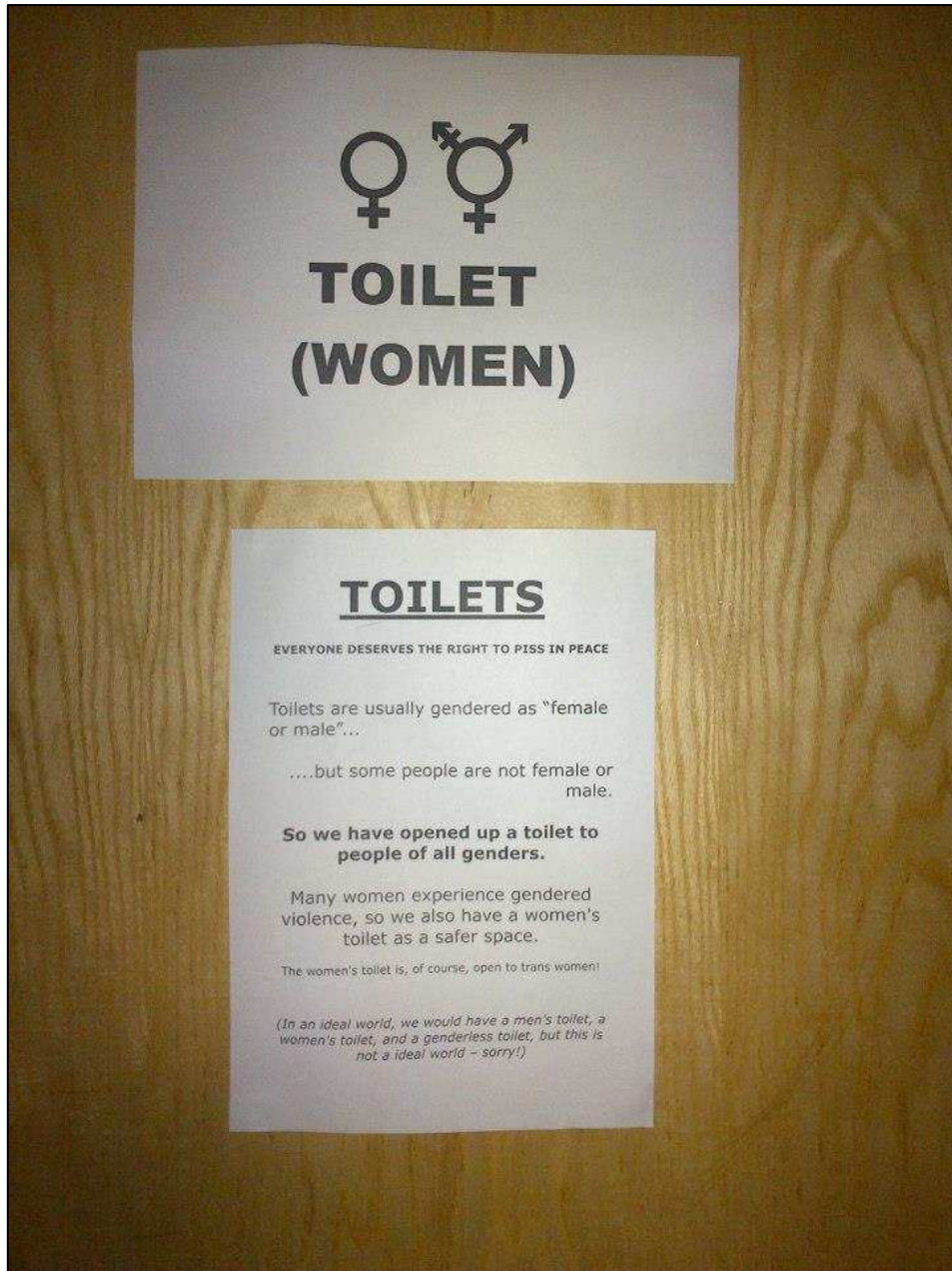
Figure 3: Toilet door sign at Revolt

seen to be of benefit to the wider world, not just to trans audiences; and in turn, it was beneficial for trans people to engage with wider communities and socio-political issues. For this reason, it made sense to organise the Trans Tent under the wider umbrella of LGBT Pride: 'trans' alone was not the overarching theme of the event. Instead, the Trans Tent was just one part of a large celebration of diversity, inclusivity and openness within a community-oriented, 'family-friendly' setting. Similarly, gigs such as the GYGL fundraiser, Queer We Go, Revolt and Cutlery Drawer gigs