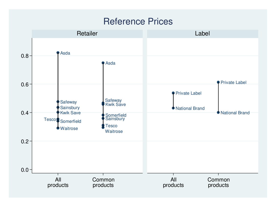
Figure 2: Contribution of Rolling Reference Prices and Sales in Price Variation (R<sup>2</sup>)by Retailer and Label