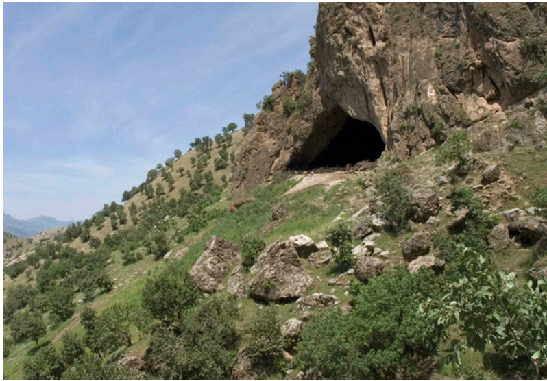
Figure 4. Shanidar Cave, like most cave and rockshelter sites where near complete Neanderthal skeletons have been recovered, is a difficult to access location even for the healthy and fully able. Individuals with severe and entirely immobilizing leg injury are likely to have stayed in more accessible locations rather than their absence in the record implying abandonment.

mobility (Shaw and Stock 2013). Indeed, Neanderthals adapted successfully to live in rugged mountainous environments, as evidenced by over 30,000 years of occupation at Esquilieu cave, for example (Yravedra and Gómez Castanedo 2014). They also dealt with encounters with often dangerous prey as well as predators (Camarós et al. 2015). There is no notable difference in adult mortality between Neanderthals and early modern humans (Trinkaus 2011), with serious pathological conditions common across archaic and early human populations (Wu et al. 2011). Estabrook comments: 'The idea that Neanderthals are more frequently traumatized than modern populations is based on little evidence, but it has been well received because it dovetails nicely with this paradigm [of Neanderthals as "dumb"]' (2009, 337). There is no reason to assume the healthcare practices in Neanderthals were driven by the necessity of a life that was unusually harsh rather than being a caring social and cultural response to illness, injury and vulnerability.