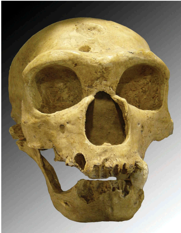
Figure 1. The crania of the La Chapelle aux Saints Neanderthal.

Analysis of LCS1 (Figure 1), a male aged between 25 and 40 years old at death, revealed that he suffered from extensive tooth loss and severe, chronic periodontal disease; temporomandibular joint arthritis; severe osteoarthritis in lower cervical and upper thoracic vertebrae, and moderate to severe degeneration of lower thoracic vertebrae; osteoarthritis in both shoulder joints; a rib fracture in the mid-thoracic region; degeneration in the fifth proximal inter-phalangeal joint of the right foot; and severe degeneration and likely chronic osteomyelitis in the left hip (Tilley 2015, 228).