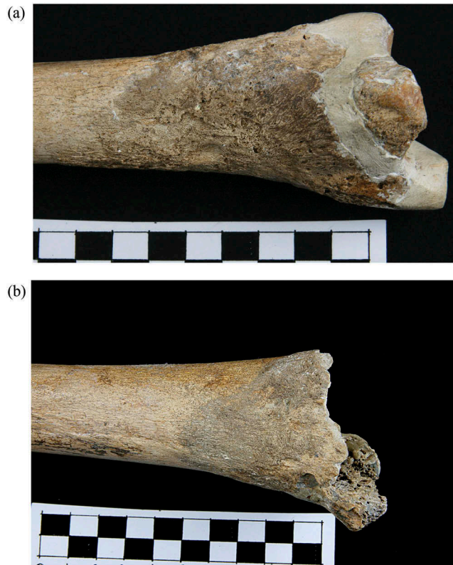
Figure 2. Examples of periosteal proliferation on LF1 (a) distal right tibia (posterior view); (b) distal left femur (posterior view) (Tilley 2015, 244).

Although not subject to detailed study of this kind, the pathologies in other Neanderthals also provide evidence for varied types of care and accommodation. Many of these individuals with severe pathology are likely to have required practices such as provisioning, maintaining body temperature, facilitation of sleep and rest, ensuring safety, maintaining or assisting mobility, maintenance of personal hygiene, maintaining posture and maintaining physiological functioning (such as by staunching wounds) (Tilley 2015, 81–82). For example, Shanidar 3 is likely to have required a period of healthcare provision and later accommodation around constraints of mobility due to their foot pathology. La Ferrassie 2, the young female adult buried in close proximity to LF1, displays evidence of a proximal fracture of the right fibula that is completely healed, although with significant distortion (Heim 1976b). In a conservative scenario, this injury would cause pain on weight-bearing and would restrict, although probably not prevent, locomotion – but it would have precluded direct participation in demanding activities, such as hunting, for around six to eight weeks (Tilley 2015, 257). These cases as well as those of notable longstanding impairments which are likely to have required accommodation also argue against a calculated approach to who might be economically ‘valuable’ in future.