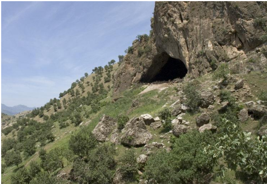
Figure 4. Shanidar Cave, like most cave and rockshelter sites where near complete Neanderthal skeletons have been recovered, is a difficult to access location even for the healthy and fully able. Individuals with severe and entirely immobilizing leg injury are likely to have stayed in more accessible locations rather than their absence in the record implying abandonment.

Lastly, a closer consideration also casts doubt on the concept of unusual levels of injury (and unusually harsh lifestyles) in Neanderthals. Whilst injuries are common in Neanderthals the rates of trauma are not unusually high within the wider context of similar hominins, both earlier archaics and early modern humans. Like other archaic and earlier humans Neanderthals lived physically demanding lives which involved high mobility (Shaw and Stock 2013) and encounters with often dangerous prey as well as predators (Camarós et al. 2015). There is no notable difference in adult mortality between Neanderthals and early modern humans (Trinkaus 2011). Serious pathological conditions are common across archaic and early human populations (Wu et al. 2011). Estabrook