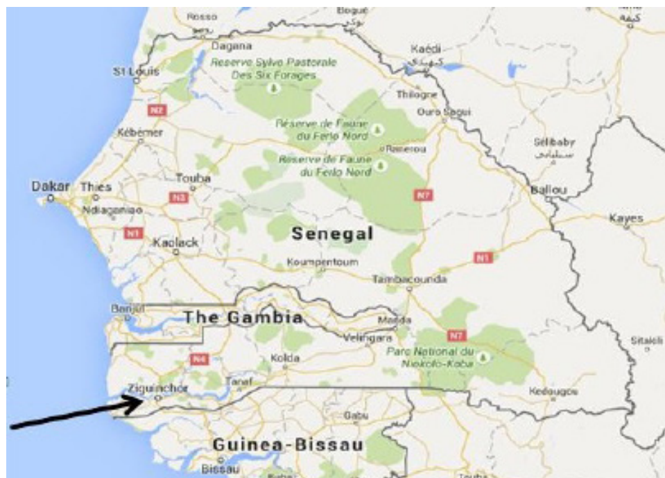
FIGURE 1. Map of Senegal

speakers (Lewis, Simons, & Fennig, 2014). Jóola languages are classified as members of Sapir's (1971) BAK group of Atlantic languages of the Niger Congo language phylum. Speakers of these languages are found in the Gambia, in the former Casamance region of Southern Senegal and in Guinea Bissau. The map in Figure 1, taken from Ethnologue, presents the languages of Senegal. The arrow on the map points to the Eegimaa speaking area (Bandial is the name used by Ethnologue for Eegimaa).