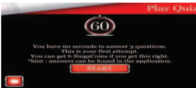
Fig. 2. The second stage (Traveller) of SingaRacer.

On gaining sufficient SingaCoins, backpackers are promoted to the rank of travellers. In the Traveller stage, users encounter periodic challenges in the form of quizzes about places they had already visited in the game. Users are required to enter the correct answers within a given time frame (Fig. 2).