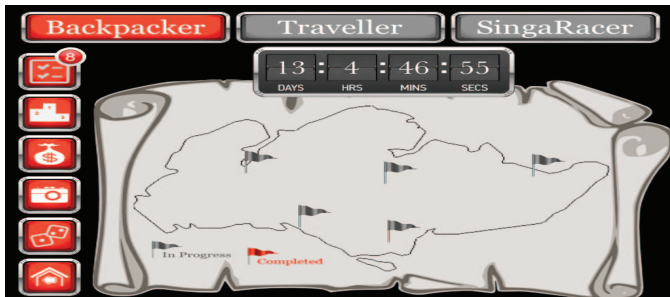
Fig. 1. The first stage (Backpacker) of SingaRacer.

Backpacker is the first stage in which users commence their race (Fig. 1). Locations, maps and directions are provided to backpackers to help them navigate. Historical and cultural information about the places of attractions is also provided. When users reach a designated spot on the virtual map, they are required to check-in. Before check-out, users are required to answer quizzes so as to earn SingaCoins.