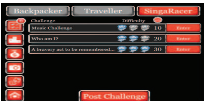
Fig. 3. The third stage (SingaRacer) of SingaRacer.

SingaRacer is the final stage that is unlocked once users have earned enough SingaCoins. Besides exploring the history and culture of Singapore, SingaRacers are allowed to submit challenges for others (Fig. 3). They can also share information on Singapore's history and culture. Information approved by administrators are made available for other users.