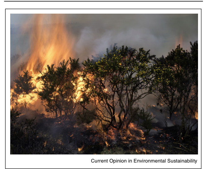
Yet to be titled (Swaling #1) 2017.

target.' Recognition of the entanglements between the complexity of global climate politics, and their sonic, material and cultural reverberations shape Critchley's experiential scenarios. They also 'provide the opportunity to distill the complex and multi-faceted research involved in climate change and create imagined spaces . . . to stop, reflect and invite challenge and debate'. At the same time as acknowledging that climate target setting can indeed be a 'prism of privilege, power and geography' [93], such work both notes and further valorises knowledge