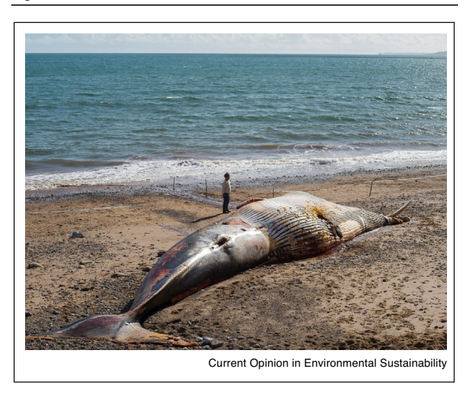
The agent, his agency and the whale, 2016.