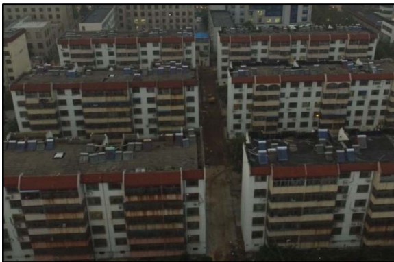
Fig. 5. Individually installed SWHs on the roof of residential buildings in Rizhao.

Presented as an outstanding local SWH enterprise, MUYANG became an important player in the popularization of SWH in Rizhao. 8 In 2013, it completed the installation of wall-mounted SWHs in more than 8000 apartments, and roof-mounted SWHs in more than 3000 apartments in Rizhao (D14).