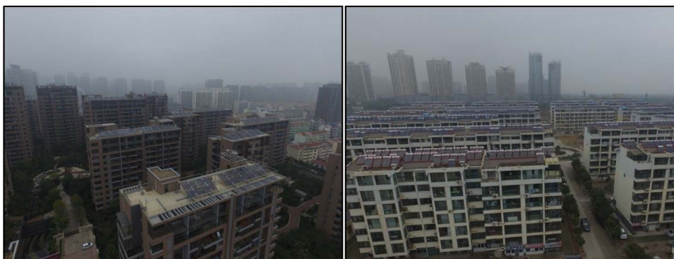
Fig. 6. The embeddedness of SWH in the urban landscape in Rizhao.

Manufacturer). As a result, there were some cases where the installed SWHs were soon after dismantled and sold as waste by users or even by the real estate developers themselves (Interview, Industry organization). Newly emergent problems further shaped the pathways of socio-technical transitions of Rizhao.