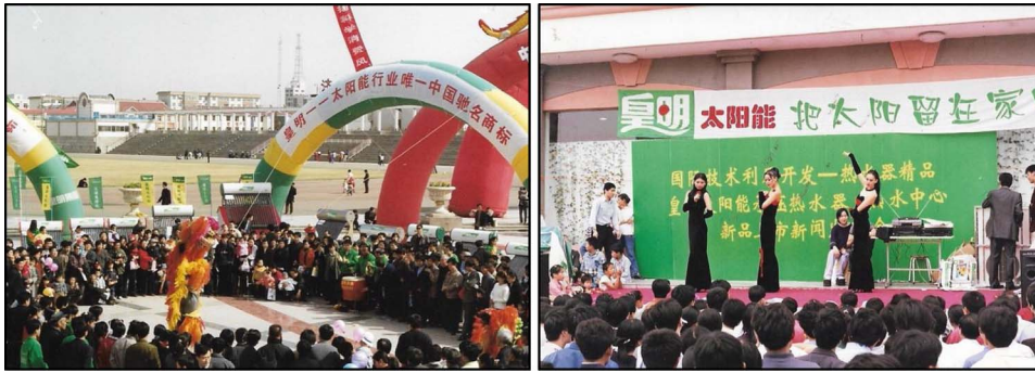
Fig. 3. Advertising activities organized by Himin in the 1990s.

interactions they exhibit? However, event analysis method cannot provide enough information on why and how these interactions occur. Semi-structured interviews were analyzed to shed light on the causal links between the three components. To sum up, event history analysis answers the ‘what’-type questions, and semi-structured interviews address the ‘why’ and ‘how’-type questions.