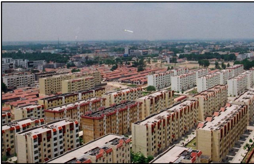
Fig. 4. A bird's eye view of the roof-mounted SWHs in Ju county, Rizhao.