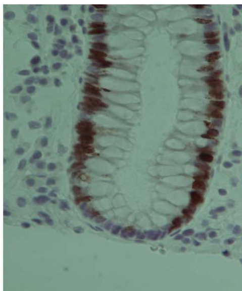
Baseline sample from participant INT-16