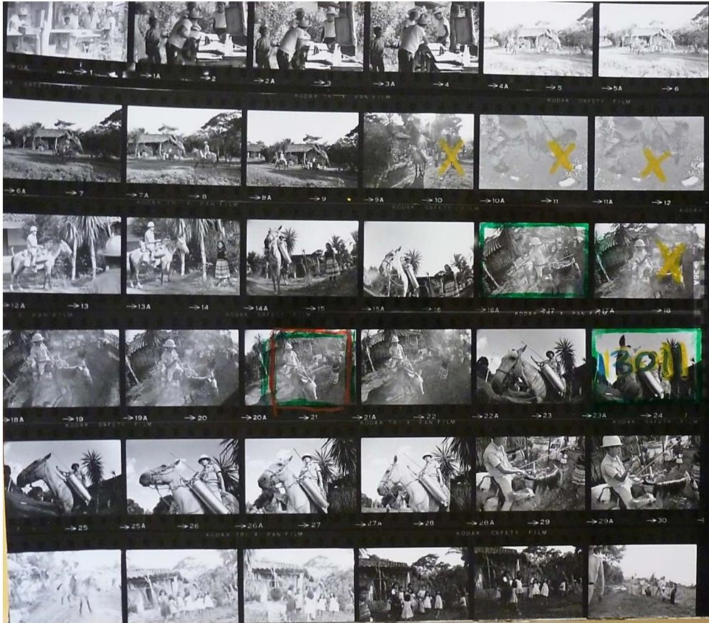
Figure 1. Contact sheet from Peter Larson, Malaria, Mexico, 1968 . Photographic Archives, Sub-fonds Photographers, WHO Archives. Copyright WHO. 73

officers direct the campaign from an operational headquarters, from which they deploy their spray-teams as though they were combat troops. “Supreme Headquarters” is WHO’s Regional Office. 74 Figure 2 displays the similar diligence applied to create a haunting photograph of one of the victims of this war. The contact sheet carries shots of the patient’s alert and piercing gaze, but the crosses show how these were rejected in favour of a sleepier vision of despair and emptiness. Her hand, extended limply out towards the viewer, was preferred to more detailed shots of her examination. The text painted her as ‘the face of malaria’, the material impact of an ‘ancient curse’ which brought ‘delirium, death and economic ruin’. 75