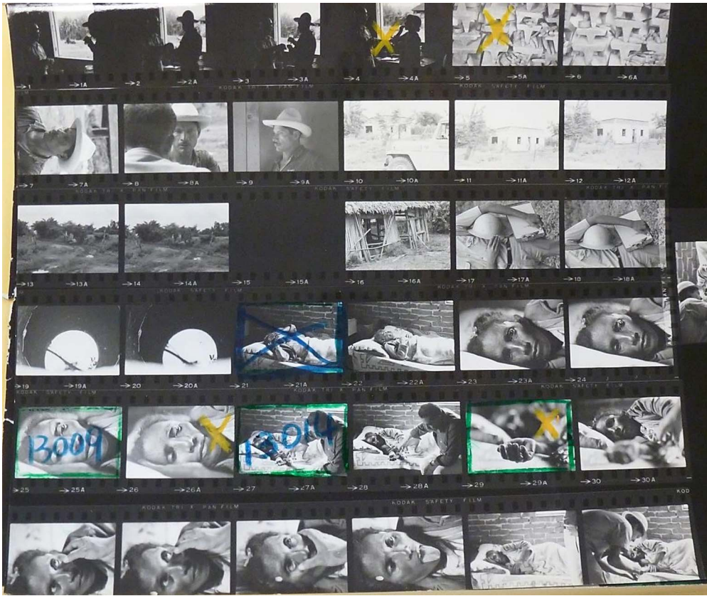
Figure 2. Contact Sheet from Peter Larson, Malaria, Mexico , 1968. Photographic Archives, Sub-fonds Photographers, WHO Archives. Copyright WHO. 76

that this was not an everyday practice, perhaps used when no other alternative was available or in response to specific time pressures. 77 Published photographs tended to appear faithful to the originals, albeit cropped and organized in relation to text and other images. The WHO wanted the photographs to speak for themselves as an unembellished and authoritative record of health ‘seen through the eyes of the WHO’. Yet, while little mechanical manipulation took place, the view was shaped in diverse ways by the instructions given to photographers, by the guides who accompanied them, by the people they photographed, and by the selection process after the films had been returned to the WHO. Indeed, as seen above, the captions and accompanying texts instructed the viewer in how to approach the images. The PIO was further complicit in skewing the picture by featuring photographs which emphasized good practice, or by including examples where programmes were fully operational. Ultimately, the process was geared towards the creation of a carefully staged drama rather than snapshots from the front lines of health.