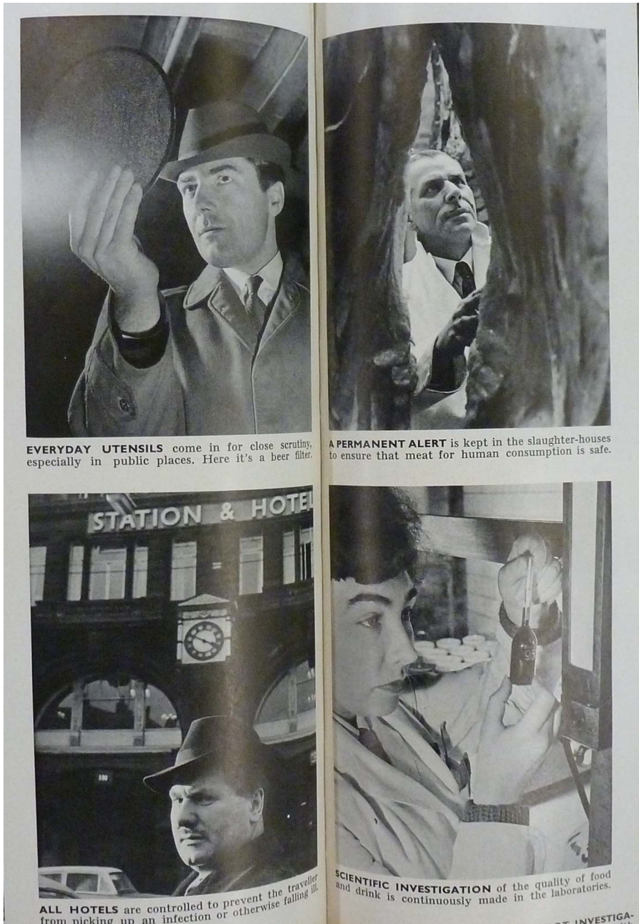
Figure 6. Detail from ‘The unknown guardian angels have faces’ photo story, World Health , September–October 1963, pp. 48–9. 86