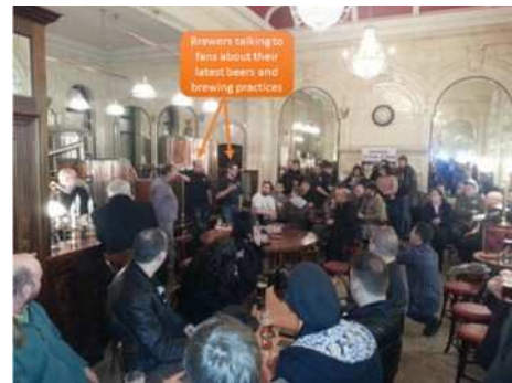
Figure 3. Meet the Brewer, brewers engaging with community

Outside of the brewery setting, one 'Bottle Sharing' and two 'Meet the Brewer' (MtB; see Figure 3) social events were attended with interviews and field notes recorded for analysis. MtB events bring together brewers and consumers of the craft beer community to participate in a discourse of craft brewing