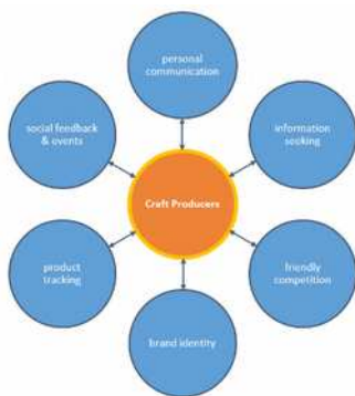
Figure 5. Craft producers GT analysis key themes

Importance was placed on who responds to consumers via social media, with a dedicated 'social media person' viewed as undesirable in-lieu of a someone who is directly responsible for producing the beer, P2: "I don't think that works really, it's a very easy way to crush people's ideas of what they want out of your brand isn't it. If you tweet something that they don't agree with, then they're going to **** you off straight away."