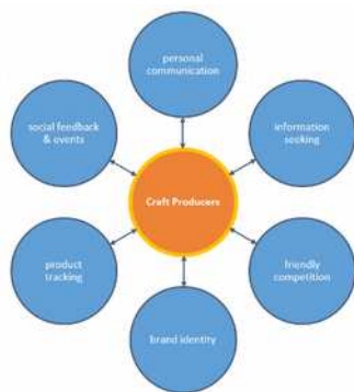
Figure 5. Craft producers GT analysis key themes

Importance was placed on who responds to consumers via social media, with a dedicated 'social media person' viewed as undesirable in-lieu of a someone who is directly responsible for producing the beer, P2: "I don't think that works really, it's a very easy way to crush people's ideas of what they want out of your brand isn't it. If you tweet something that they don't agree with, then they're going to **** you off straight away."