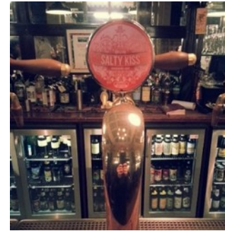
Figure 6. Brewery pump-clip artwork

perceive their brand, for example through their use of social media and beer artwork, particularly on pump clips for serving beer (see Figure 6).