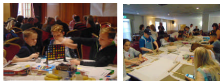
Figures 4 & 5. Activities at Event 2 & 3