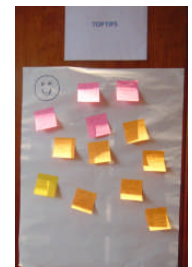
Figures 6. Obtaining Feedback