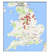
Figure 2: North of England Spread of Children with Narcolepsy

The aim of these events are to enable the families to interact, discuss their concerns, share ideas and keep up to date with the latest narcolepsy research.