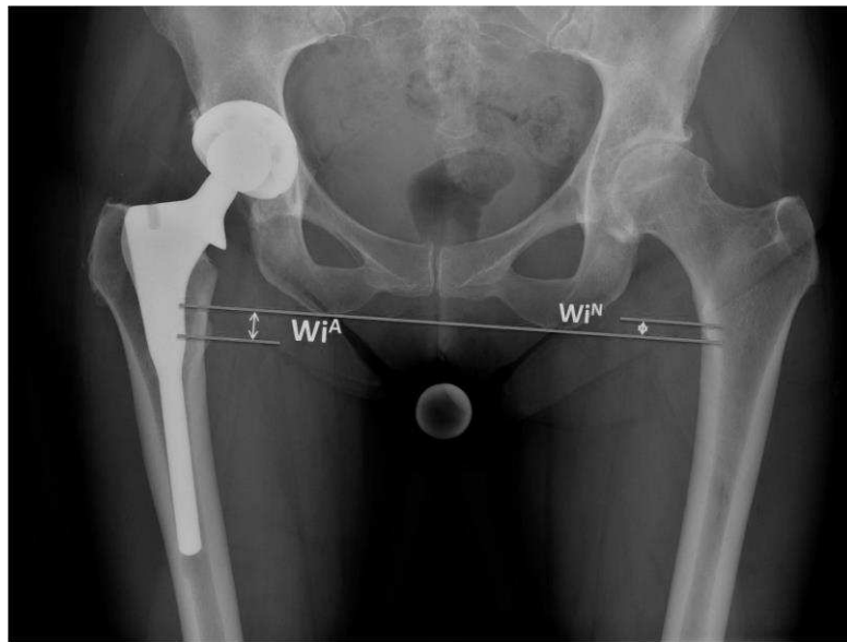
Fig 2 The Williamson method.

'Direct' method (Fig 3) and a locally developed 'Leeds' method (Fig 4).