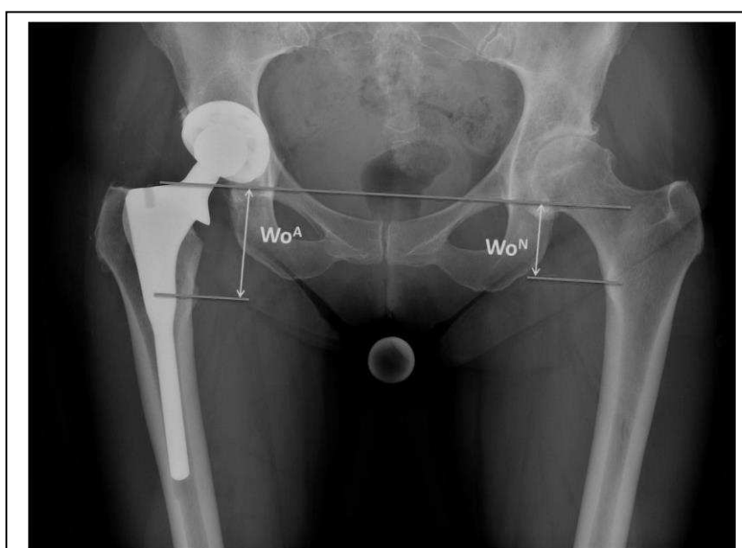
Fig 1 The Woolson method.

Four methods of quantifying LLI from AP radiograph were used. The Woolson, Hartford et al method [33] (Woolson method) (Fig 1), the Williamson and Reckling method [22] (Williamson method) (Fig 2) which are prominent in the literature, a