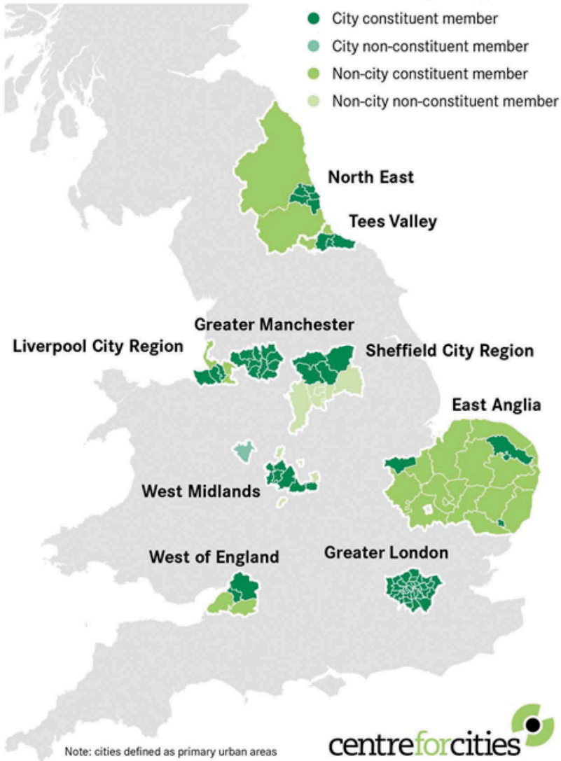
Figure 1. City-regions with an elected Metro-Mayor.