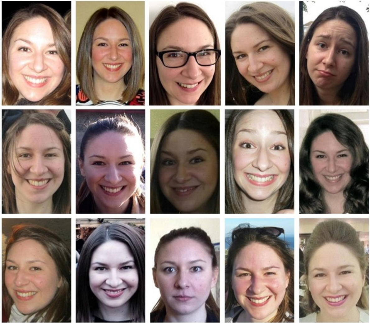
Figure 1. Example stimuli for Experiment 1. Multiple images showing the same identity, but varying in lighting, colouring, hairstyle, etc. [Copyright restrictions prevent publication of the actual images used, though these are available from the authors. Images in Figure 1 are illustrative of the experimental stimuli, and depict someone who did not appear in the experiments but has given permission for the images to be reproduced here.]

Following the ratings task, participants completed a speeded name verification task. A name was displayed on the screen for 1500 ms, and then replaced by an image which remained on the screen until response. On half of the trials, the face matched the name. Participants responded via button press, indicating whether the image showed the same person as the name or not, and were instructed to respond as quickly and as accurately as possible. There were 15 match trials per identity, each showing the person named, and the images previously rated for likeness. The 15 mismatch trials per name showed 5 images of three of the other identities, counterbalanced across identities to ensure each name and each person were seen