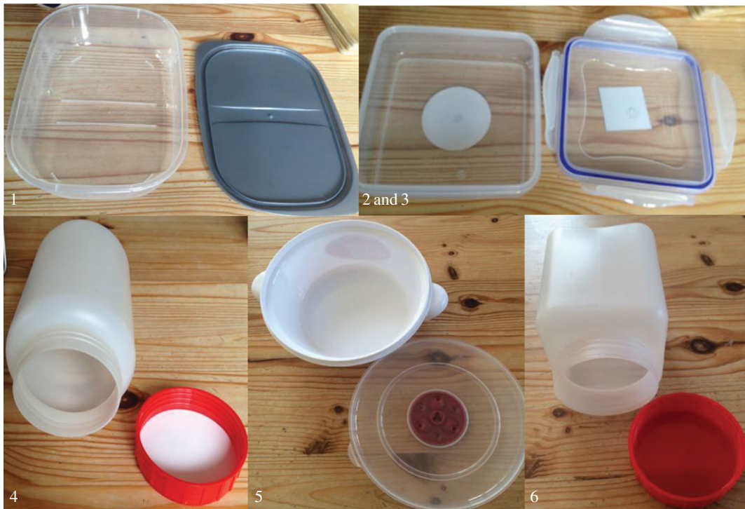
Figure 1. The novel extractive foraging tasks presented to the smooth-coated otters. (1) A simple plastic box ( 55 \times 175 \times 130 mm); (2) a plastic box with clips on the lid ( 45 \times 135 \times 135 mm); this box was used as both tasks 2 and 3, once with four clips closed (task 2) and then with two clips closed and two clips removed (task 3); (4) a round plastic jar with screw-top lid ( 180 \times 90 mm diameter); (5) a round plastic tub with a pull-off lid ( 70 \times 170 mm diameter); and (6) a square plastic jar with screw-top lid ( 180 \times 85 \times 85 mm). Each task was baited with half a fish and covered with its respective lid. The tasks are numbered in assumed order of difficulty with 1 being the easiest and 6 being the hardest.

have more trouble solving the task types that, from our personal experience opening the tasks, required more complex extractive foraging techniques (e.g. figure 1 tasks 5–6; figure 2 tasks 3–4), and would thus be more inclined to copy each others' solutions to those task types.