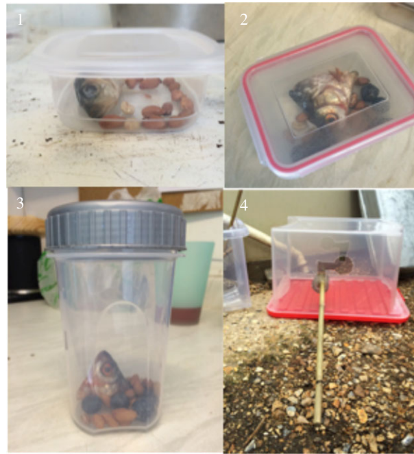
Figure 2. The novel extractive foraging tasks presented to the Asian short-clawed otters. These differ from those presented to the smooth-coated otters (figure 1), as in this second iteration of the experiment on the second study species we wanted to create a more explicit range of task difficulties. Tasks were also slightly smaller to accommodate the smaller size of this otter species. (1) A simple plastic box ( 40 \times 100 \times 100 mm); (2) a plastic box with two clips ( 45 \times 100 \times 85 mm); (3) a plastic tub with a screw-top lid ( 130 \times 75 mm diameter); and (4) a frozen reward on a bamboo cane that had to be moved up and to the right to fit through the hole. The numbering of the tasks is in intended order of difficulty, with 1 being the easiest, and 4 being the most difficult. These tasks were baited with peanuts and one fish head per task at the New Forest Wildlife Park, and peanuts and mealworms mixed with either half a mouse or day-old chick legs at Paradise Wildlife Park. Task 4 required a different type of reward due to its design, so this was a block of ice with shrimp or mealworms frozen inside.

than the TADA variant of NBDA [36], and here we did not have exact times of acquisition, so we initially used OADA. However, the social networks for Asian short-clawed otters were highly homogeneous (see Results), meaning OADA was unable to estimate the effect of social transmission with precision. We, therefore, also used a discrete TADA [35,36] to estimate the effects of social transmission for this species, with time divided into 1-min periods (see electronic supplementary material). This also allowed us to estimate the relative difficulty of each task for the Asian short-clawed otters.