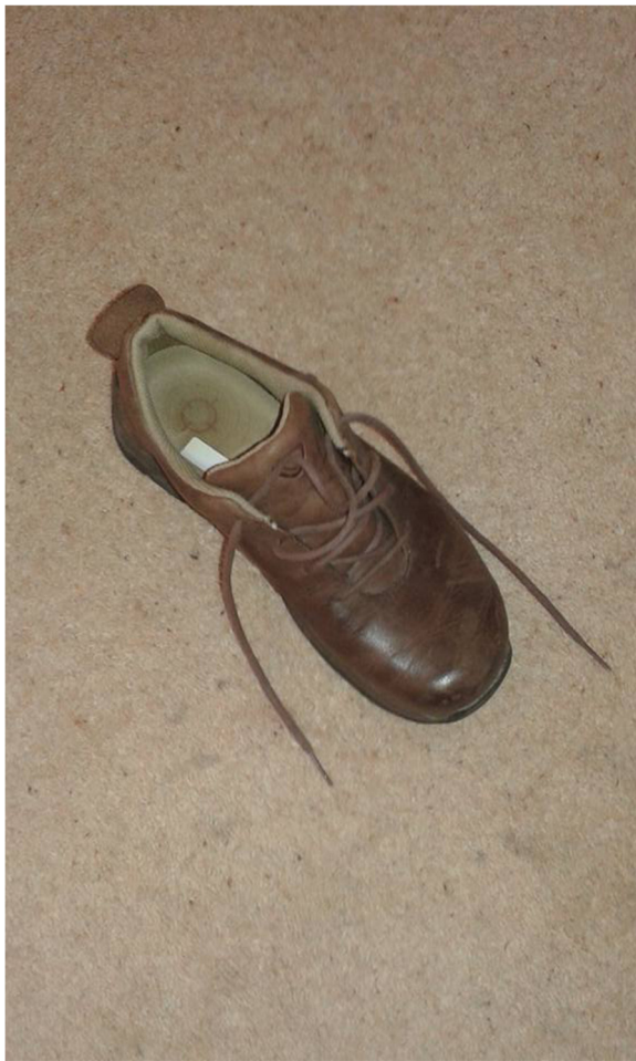
Fig. 2 Nigell's shoe

great grandmother in her eighties who was very resistant to attempts by podiatrists to encourage her to wear more supportive shoes: