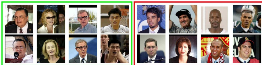
Fig. 2. A column in the green box indicates the same person and the red box indicates different people.

We use the standard caffe library [15] to train our deep models. The two CNN architectures we used are VGG-16 [2] model and WebFace model [19]. These two architectures achieve great success in the field of face recognition. Our models are trained using the CASIA-WebFace dataset [16] consisting of 419922 face images of 10575 identities. The training images are horizontally flipped for data argumentation. The finetuning process during model compression is conducted on CASIA-WebFace dataset as well. The face recognition performance is evaluated on the famous LFW (Labeled Faces in the Wild) database [21]. LFW contains 5,749 subjects and 13,233 images. We follow the standard unrestricted protocol and conduct 10-fold cross validation. The face recognition rate is evaluated by mean accuracy. The sample images of LFW are shown in Fig. 2 All the experiments are conducted on a computer equipped with Nvidia Tesla K80 GPU.