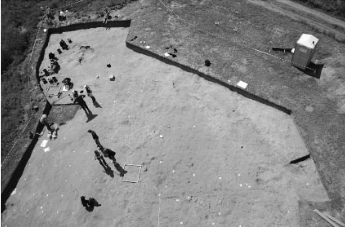
Fig. 2 Aerial view over the excavation trench with the Mesolithic hut site under excavation in the mid-left of the picture.