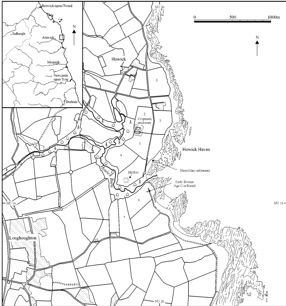
Fig. 1 Howick Location Map.

charred material whilst magnetometer survey had recorded sub-surface anomalies in the vicinity of the erosion scar and to the north of this area. During the 2002 season an excavation trench was therefore opened next to the erosion scar along the edge of the cli and extended