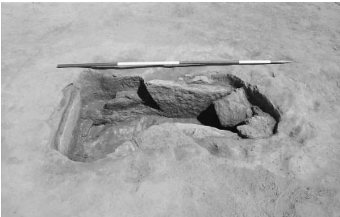
Fig. 5 Cist 4 during excavation (scale: 2m).

and Mesolithic remains on the same site is not just evidenced at Howick: elsewhere in Northumberland the sites at Low Hauxley (SMR records), Goatscrag (Burgess 1972), Ross Links (Brewis 1928) and Birkside Fell (Tolan-Smith 1997) all had Bronze Age remains found in association with Mesolithic sites.