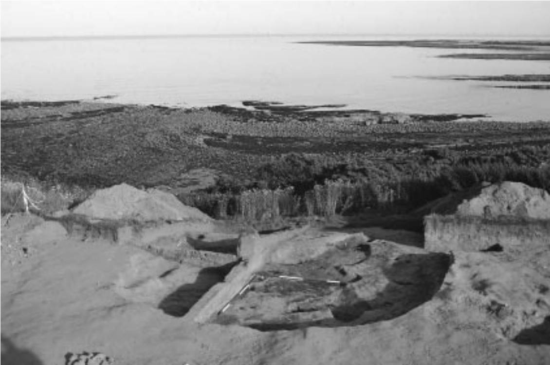
Fig. 4 The Mesolithic structure during excavation looking east.

similar form with generally irregular shapes and profiles. Their spatial proximity to the Mesolithic hut site and their position in a discrete cluster suggests some belong to the Mesolithic phase of activity on the site. Their function is unclear, but they contained occasional flints, charred hazelnuts, charcoal and marine shells suggestive of domestic activity. One of the pits, with a clay-lined base, was truncated around its edges by modern sheep burials; its function is not yet clear and no obvious parallels are known from other coastal Mesolithic sites but it was clearly associated with heating/fire-based activities and the clay may have been included to intensify temperatures.