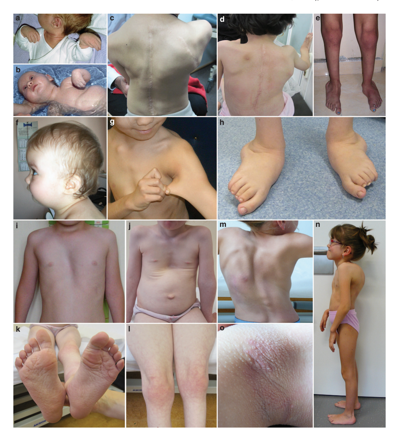
Figure 1 Clinical phenotype of patients with FKBP14-kEDS. Consent for publication of patient photos was obtained for each subject. (a,b) P1 from the original publication<sup>4</sup> showing wrist-drop of both hands in early infancy (a,b, age 2 and 6 weeks). (c) P3/FIII at age 10 years after surgical correction of the severe thoracolumbar scoliosis. (d) P2/FII at age 8 years after surgical correction of the progressive severe scoliosis. (e) P1/FI at age 8 years with pes planovalgus and rocker bottom feet. (f,g) P7/FV showing micrognathia (f, age 1 year), and hyperextensible skin (g, age 8 years). (h) P10/FVIII at age 12 years with pronounced pes valgus. (i) P12/FX at age 8 years presenting with pectus excavatum. (j–l) P13/FXI at age 5 years presenting with pectus excavatum, umbilical herniae, and wrinkly, redundant skin (j), pronounced criss cross pattern of the soles (k) and cutis marmorata (l). (m–o) P8/FVI at age 6 years (m,o), and 8 years (n) showing scoliosis (m), hyperkeratotic skin eruptions in the pressure areas under the thoracolumbar orthosis (o), and mild flexion contractures of the elbows (n).