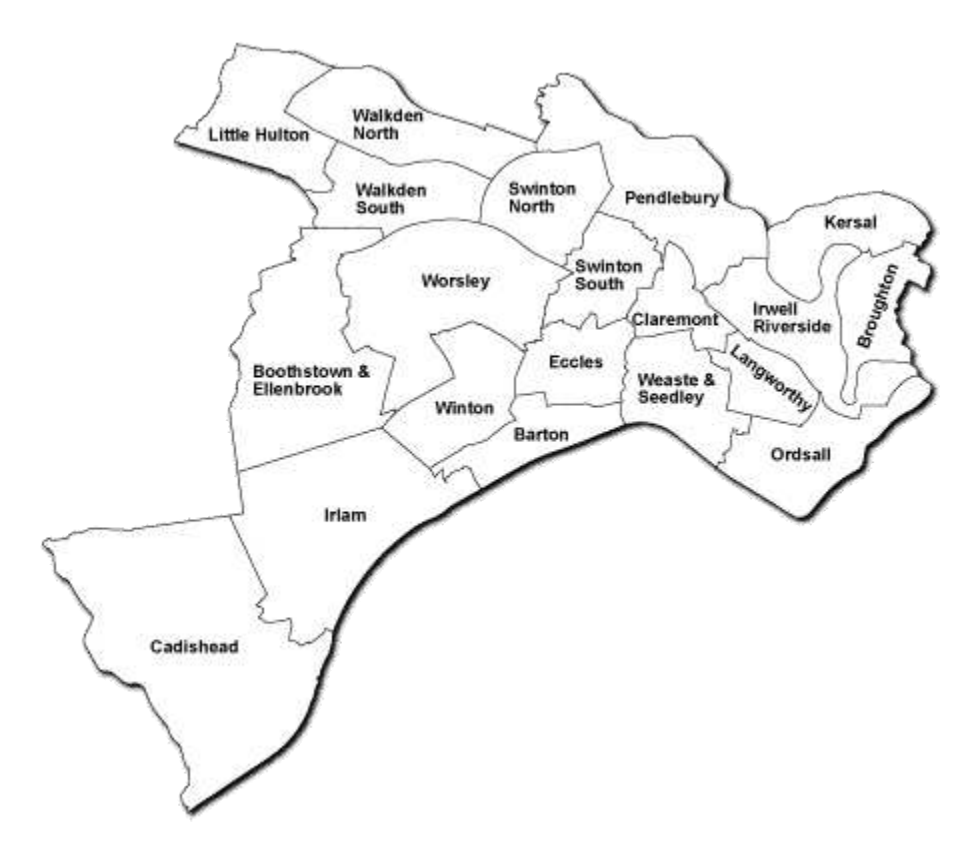
Figure 2: Location of CHALK in Salford

The NDC programme offered funding for ten year neighbourhood initiatives in 'deprived' communities across England between 2001-2011 and was designed to stimulate 'partnerships' with local residents to deliver additional investment in public services.