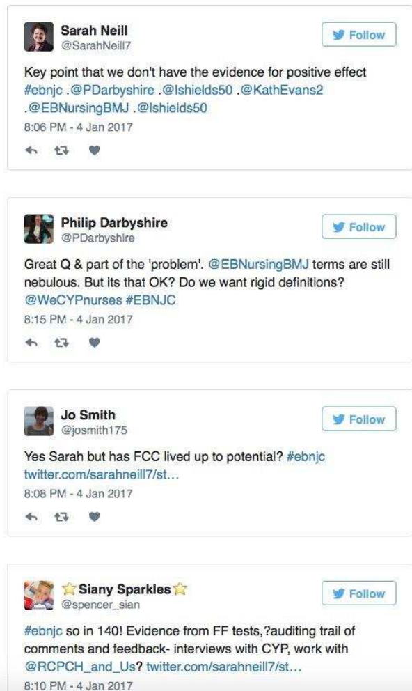
Figure 1: Is there an evidence base supporting FCC?

The second theme related to whether FCC marginalises the voice of the child. This was a fascinating discussion thread that for some seemed to exemplify the kind of Cartesian dualism that so much of nursing and health care falls into. Why, for example, would care that has a family and their wishes, needs and interests at the centre automatically preclude or ignore the child's 'voice'? Is it assumed that the child is somehow not part of this family or is it assumed that FCC involves a hierarchy with parents at the top and the child at the bottom? Where, in this hierarchy would young people sit? A collaborative action research involving children, their families and health professionals, might provide a route to the development of 'best practice' models, grounded in the United Nations (1989) Rights of the Child (Figure 2). Taking a collaborative approach provides an opportunity to shape future care models from the perspectives of those receiving care, not just those providing care.