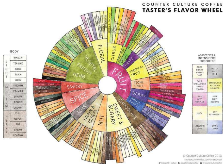
Figure 1. Counter Culture Coffee’s flavor wheel. Courtesy Counter Culture Coffee.

The participants were split into two groups (each n = 12 ). The first group (“describers”) was sequentially presented with small cups of three distinct coffees. Two of the coffees came from the same farm in El Salvador using the same Kenia and Bourbon beans but processed differently (either washed or natural) to give related but distinct flavors. The third coffee came from Rwanda using heirloom and Bourbon beans. Coffees were batch brewed by Laynes Espresso, a well-regarded Leeds coffee shop, and kept at the same temperature to ensure taste consistency.