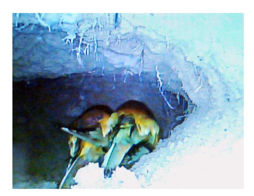
Figure 2: Endoscope picture showing pair-sleeping of European Bee-eaters - May 31<sup>st</sup> 2014, 8:10 PM, Susak Island.