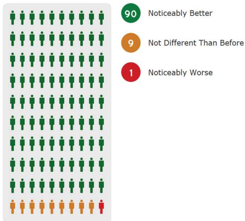
Figure 3: Screenshots of the user interface