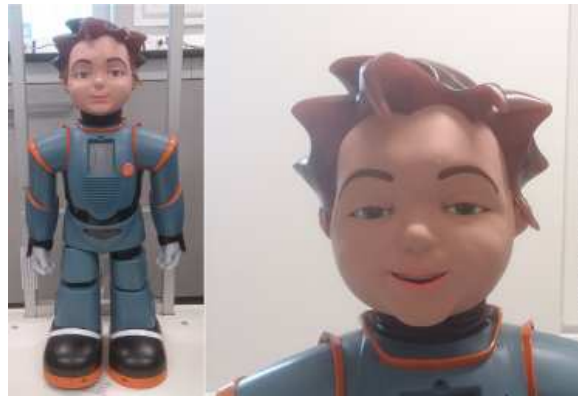
Fig. 1. The Robokind Zeno R25 platform (humanoid figure approximately 60cm tall)

The Expressive Agents for Symbiotic Education and Learning (EASEL) project [30, 31] explores children’s interactions with, and perceptions of, a humanoid synthetic tutoring assistant, using the Robokind Zeno R25 platform (citehan-son2009zeno, Figure 1). The current study draws from EASEL research exploring children’s representations - through interview, questionnaire, and open-ended HRI - of the humanoid as being something between animate and inanimate [25, 26] to provide children the opportunity to clearly articulate the potentially boundary-spanning nature that a humanoid robot can appear to have [1].