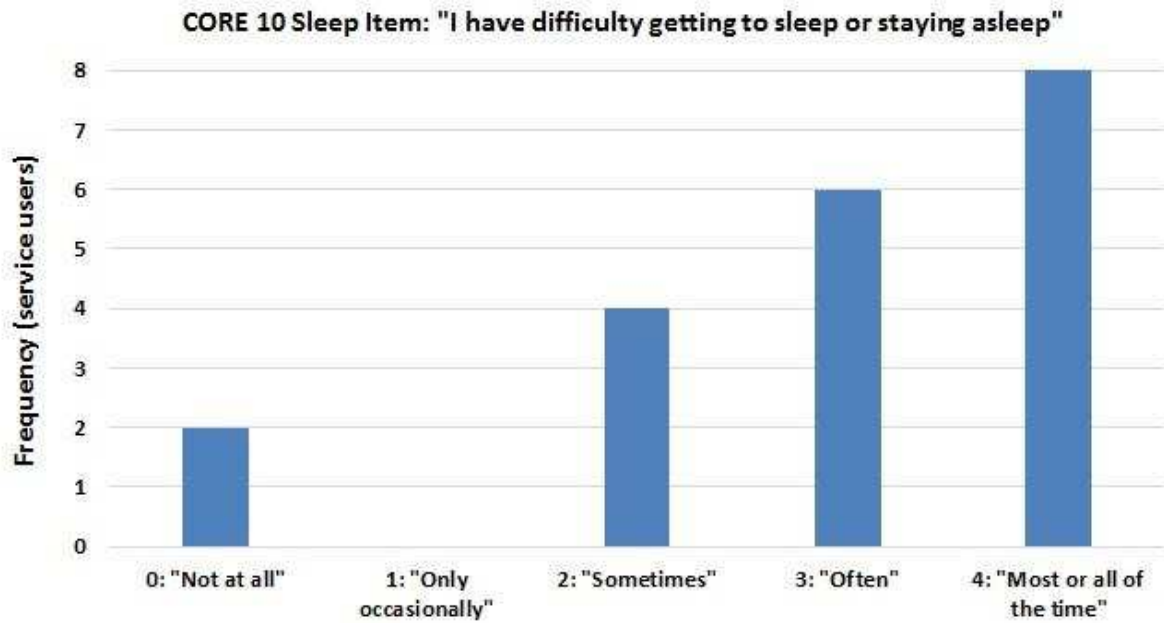
Figure 1. The frequency of reported sleep disturbances on the CORE-10 Sleep Item in the clinical sample ( N = 20 ).