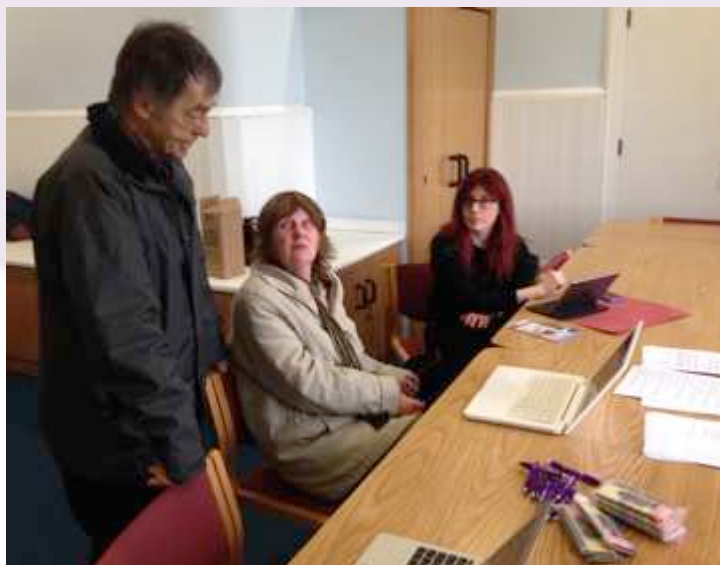
Figure 3: User engagement event at Elgin Library

The user engagement event was limited in scope as it was during a weekday and was dependent on recruiting participants who were in the library at the time of the event. It was originally intended to do more formal user testing and recorded interviews but this proved to be impractical due to limitations in the space that was available for the project team.