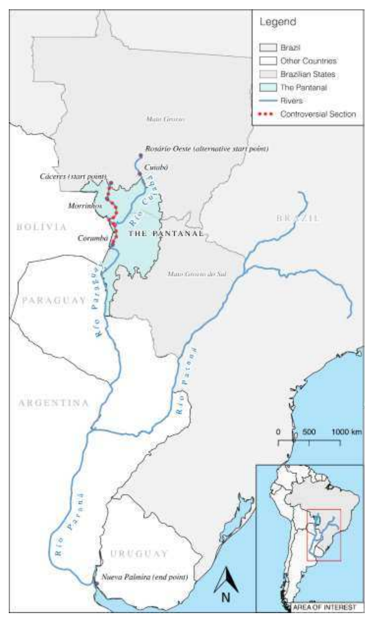
Figure 2: The Paraguay-Paraná Waterway in South America [USE COLOUR ONLINE ONLY, NOT IN PRINT]

The Paraguay-Paraná Waterway stretches 3442 km from Cáceres in Mato Grosso, Brazil to the port of Nueva Palmira in Uruguay, connecting the Paraguay and Paraná River Basins, which are part of the greater La Plata basin and partly within the countries of Paraguay and Argentina (ANTAQ 2013: 3; see figure 2). Sometimes a stretch of the Cuiabá River, an important tributary of the Paraguay River, is included, which would see navigation passing through the capital of Mato Grosso, Cuiabá, up until Rosário Oeste to the north (ANTAQ 2013). Historically, the Paraguay and Paraná rivers had been used for navigation by local indigenous people and early colonisers, leading to the foundation of several towns and cities along these rivers (Calheiros et al. 2012). During most of the 19th century, navigation along the Paraguay and Cuiabá rivers was the main means of transportation to