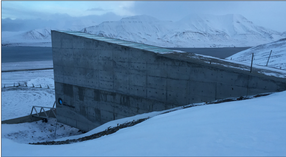
Figure 2: The Svalbard Global Seed Vault (SGSV), located on the island of Spitsbergen in Arctic Norway, is one of the Heritage Futures programme partners. Co-operated by Nordgen (the Nordic Genetic Resource Center) and the Global Crop Diversity Trust, it aims to provide a secure repository for the maintenance of global crop diversity.

and experimental exhibition work (after Macdonald and Basu 2007). The outcomes of the project will be shared with practitioners, policy makers and academics through a range of outputs, including training and capacity building resources, policy briefings, short films, books and journal articles.