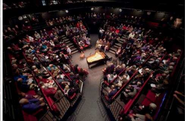
Figure 1A & 1B: Image of The Studio at the Crucible in Sheffield (© Andy Brown taken as part of The Image Speaks Exhibition).