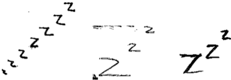
Figure 5: Draw side of B1 and 2 participants' Write-Draw cards.