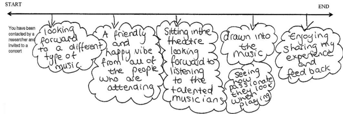
Figure 2: Band 1 timeline.